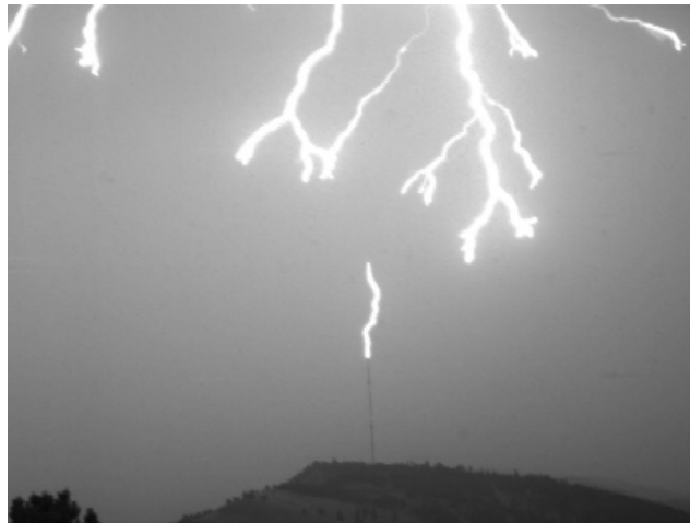
Photo: Upward Streamer and Downward Leader Activity in a Lightning Strike

Direct lightning strikes can be neutralized by a structural lightning protection system (a structural LPS). The main components of this system are air terminals (otherwise known as lightning rods), conductors linking the air terminals, and down conductors, which connect the air terminals to earth. In accordance with the basic principles of physics, a structural LPS generates an electrical “streamer” that intercepts a downward electrical “leader” from the storm cloud. This interception establishes a circuit, allowing the structural LPS to conduct the lightning current to the earth, bypassing the building structure while equalizing the potential between the cloud and the earth.